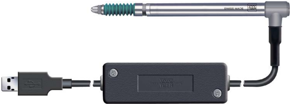
GT 62 USB probe with measuring range of \pm 5 mm

The USB probes maintain all the unique characteristics of precision, repeatability and durability for which TESA inductive probes have been famous for over 40 years. These comparative measurement instruments reach a precision below one micron in both static and dynamic measurement modes.