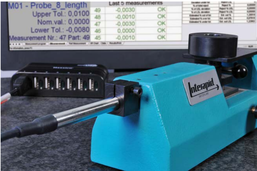
Use of a USB probe with an INTERAPID SHE measuring bench

The measuring inserts can be exchanged and replaced. Thus, every user can chose the appropriate insert among a wide range of different geometric forms and sizes. Furthermore, all USB probes are delivered with a measuring report.