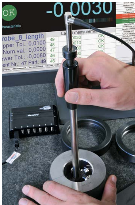
Comparative interior measurement with a USB probe, a VERIBOR and a setting ring

The TSIP software, which enables the display of values from one to four probes as well as entering tolerances, is included in the delivered contents. It offers numerous functions such as zeroing on a setting standard, the combination of two USB probes +A+B or +A-B and automatic or manual data acquisition. Moreover, all measuring results can be saved in XML format.