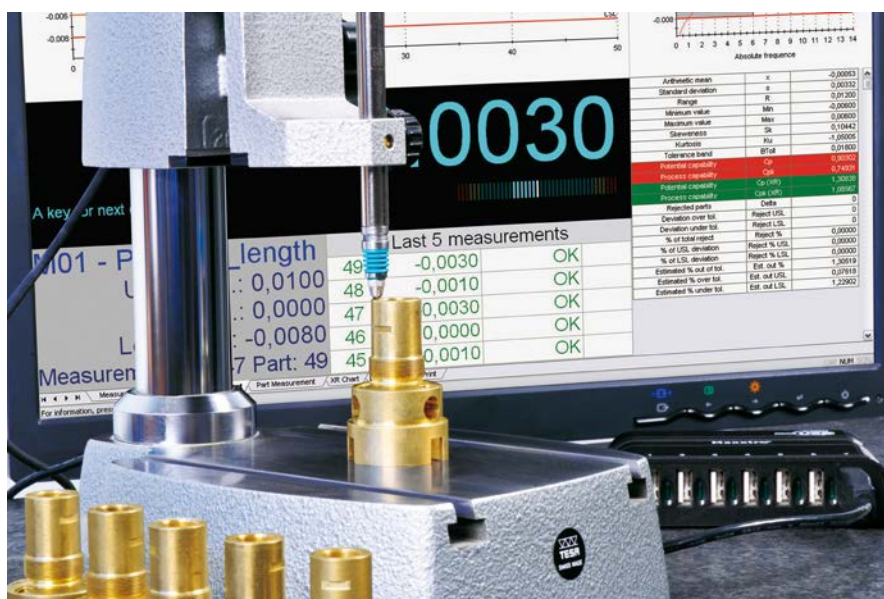
Measurement of a batch of workpieces and display of results with STAT-EXPRESS software

It is also possible to use the TESA DATA-DIRECT or TESA STAT-EXPRESS software with the USB probes; these programs are available as an option and offer advanced functionalities such as data export as CSV files or the creation of detailed measuring reports and statistics.